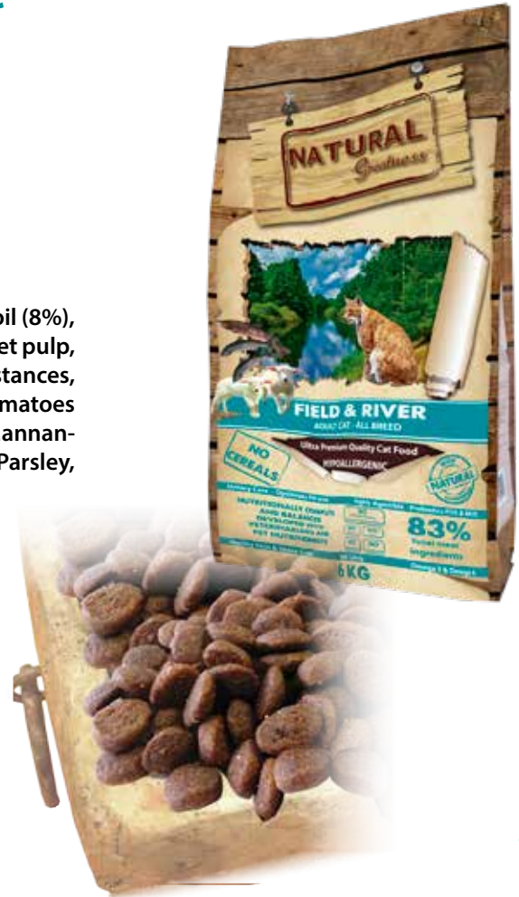
Kibble size (aprox.)