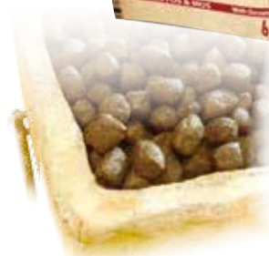
Kibble size (aprox.)