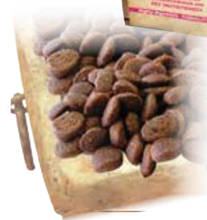
Kibble size (aprox.)